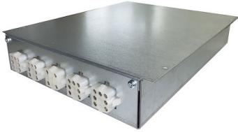
CONNECTION BOX 4 FOYERS I369 B40